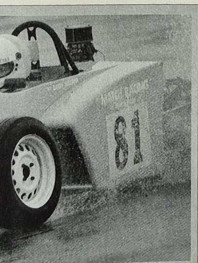
and all the way, but had to settle for third

to fourth, but by now the leading trio were some way up the road and he had little chance of catching them.