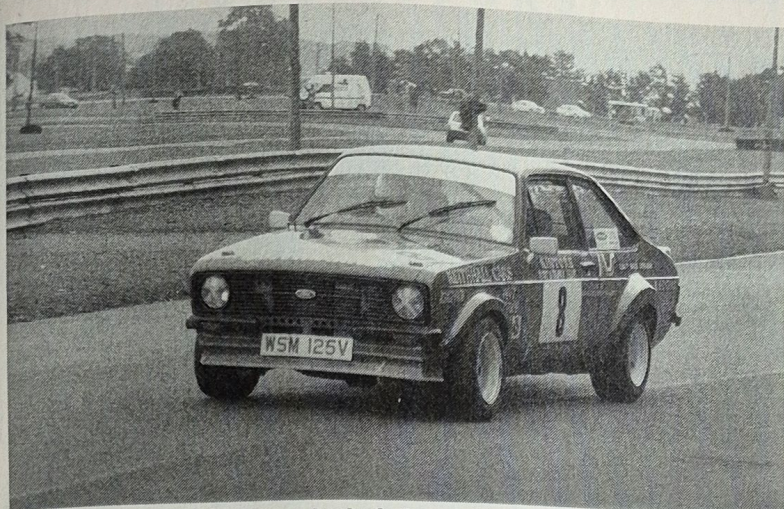
Ingliston - Warren Dunbar came out on top in the over 1600cc Road Saloon race